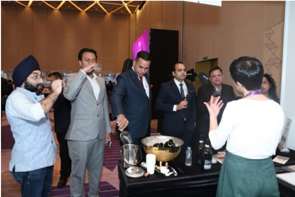
Visitors tasting wines of Vinum Hadrianum

Sparked with curiosity I requested her to tell more, to which she obliged and went on to explain the guiding philosophy of her wine house, the brief of which is in following paragraphs.