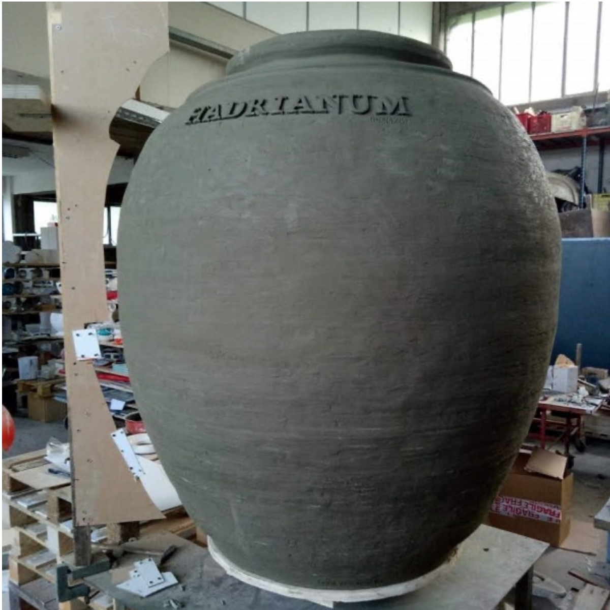
Modern day Amphorae at Vinum Hadrianum

Fast forward to present day, the Vinum Hadrianum felt that instead of looking for contemporary and even futuristic methods for making wine, why not rediscover and adopt the successful methods of their ancestors like using using amphora in their winemaking process. And this formed the basis of the philosophy of their winemaking: