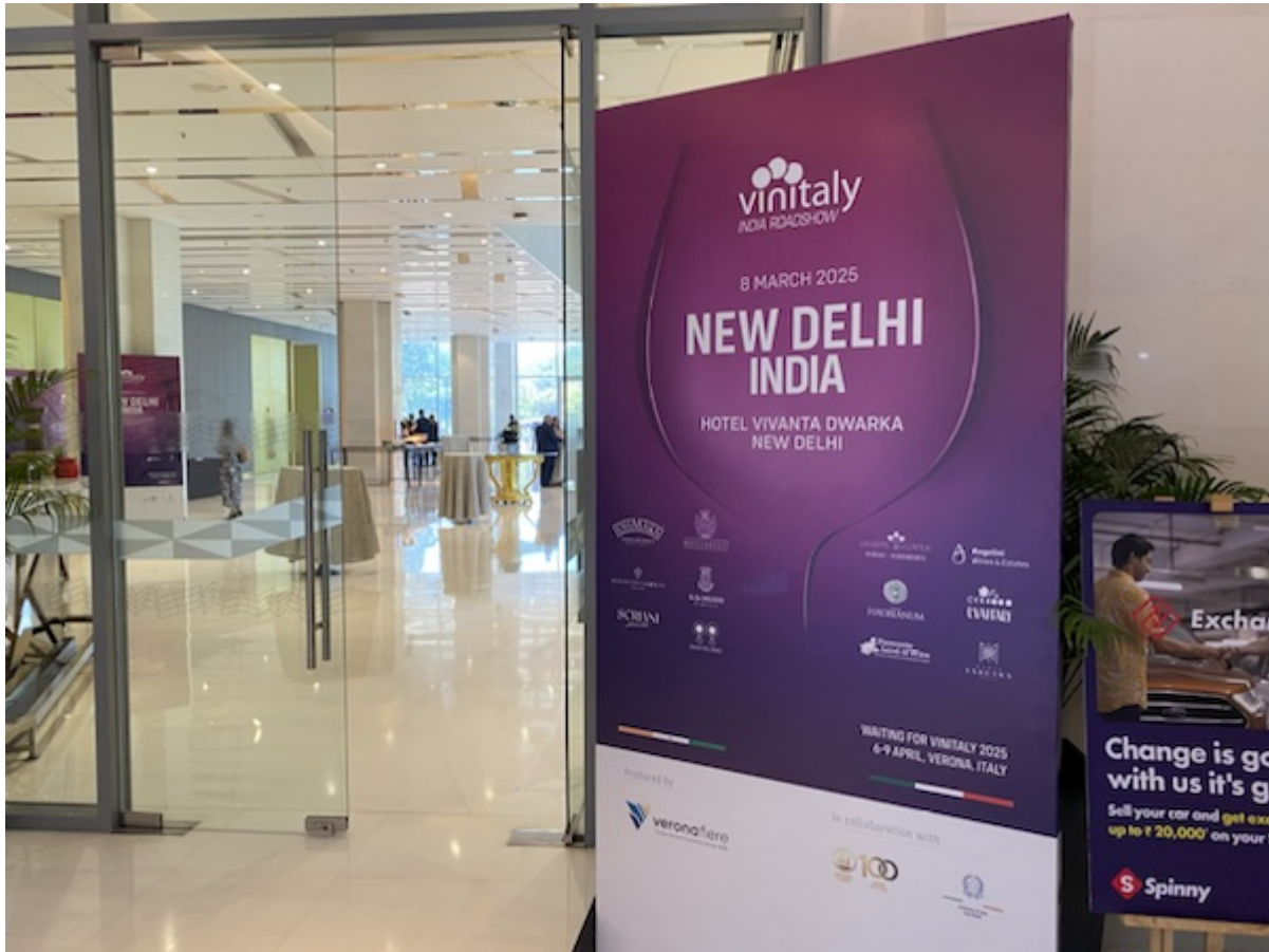
Vinitaly India at Hotel Taj Vivanta at Dwarka Delhi

Conducted by the Indian Chamber of Commerce this event had representation from twelve wine producers spread across the map of Italy , each of which showcased their range of wines at dedicated enclosures in a huge hall at Hotel Taj Vivanta at Dwarka Delhi.