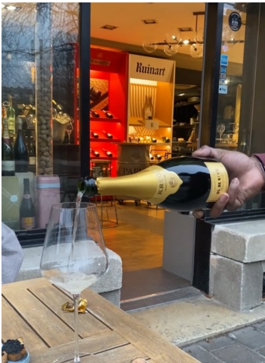
Le Parvis Champagne Bar in Reims

If I have to sum up my experience in one word then I would say that Krug Grand Cuvee 173eme is a generous champagne.