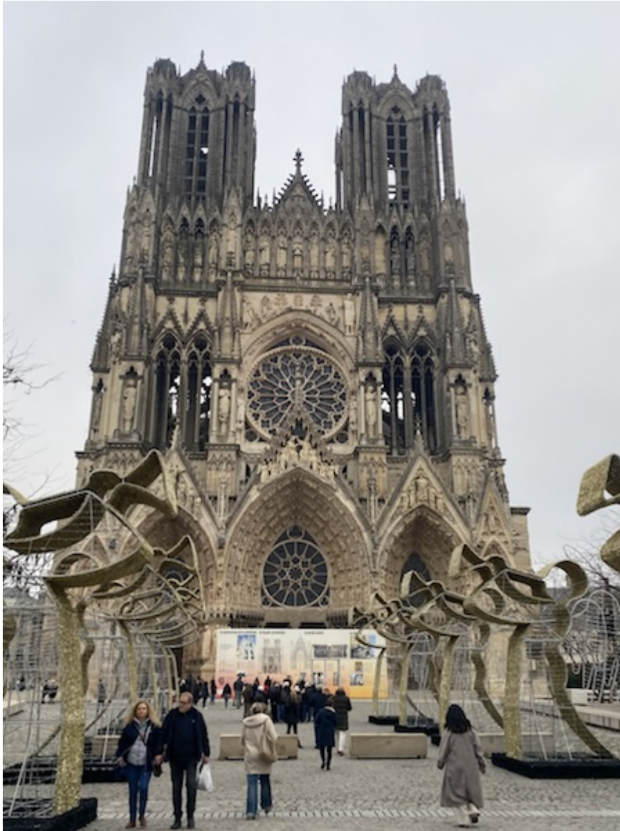
Majestic Reims Cathedral

While wandering through the lively streets of Reims, as we took a quiet side turn, our eyes encountered the majestic façade of Cathedral Notre-Dame de Reims – it was towering and dominating. Its immense presence felt almost deliberate, as if it were making us aware of its quiet authority over the city.