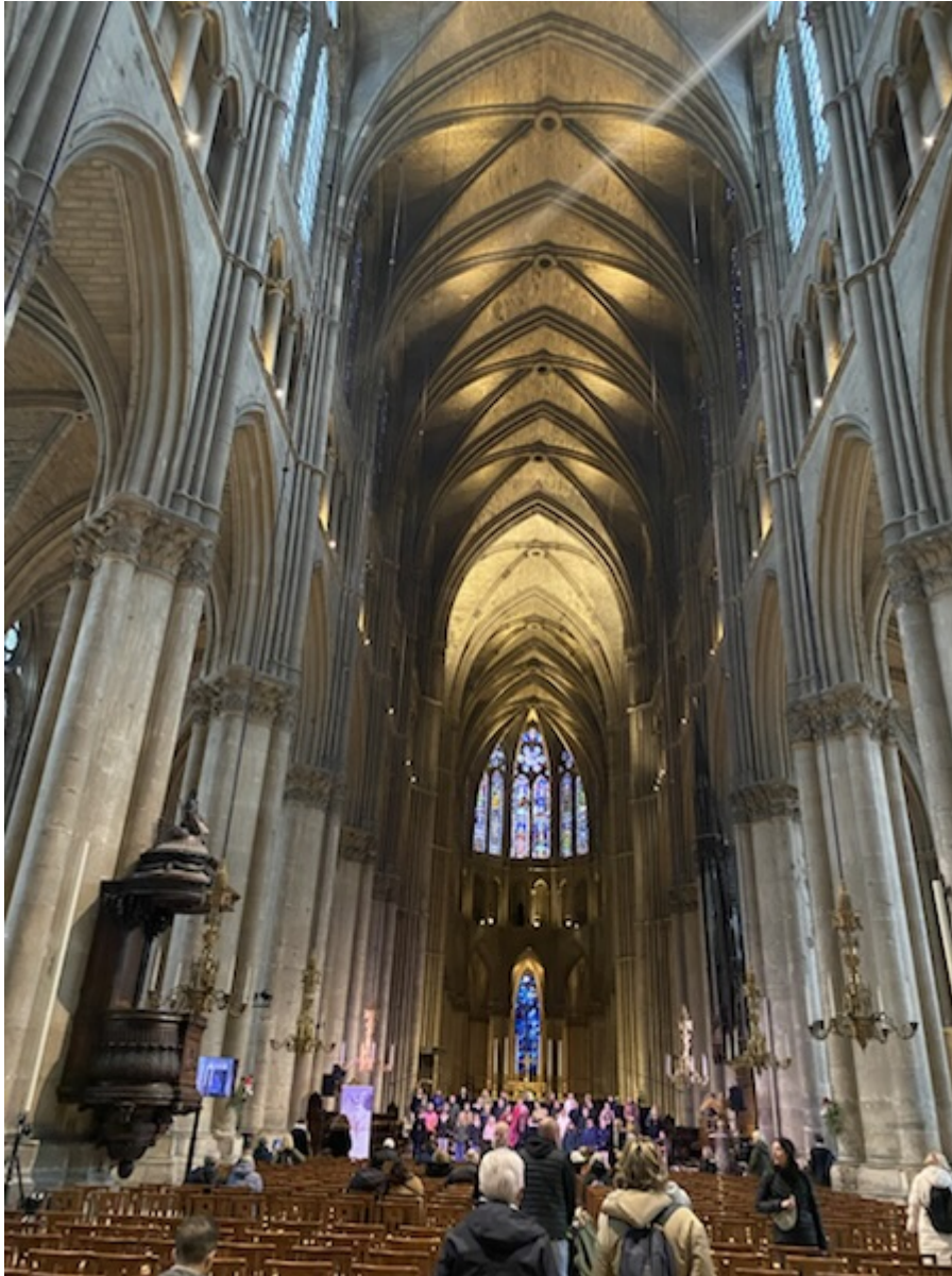
Plush interiors of CathÃ©drale Notre-Dame de Reims

On entering inside this historic cathedral, we were awestruck by its massive scale and rich interiors. The soaring roof made one feel humble and small, while the decorations and frescoes lent the space a deeply religious aura. A sense of awe and reverence gripped the mind, even as the cathedral buzzed gently with activity, children practicing choir at its centre.