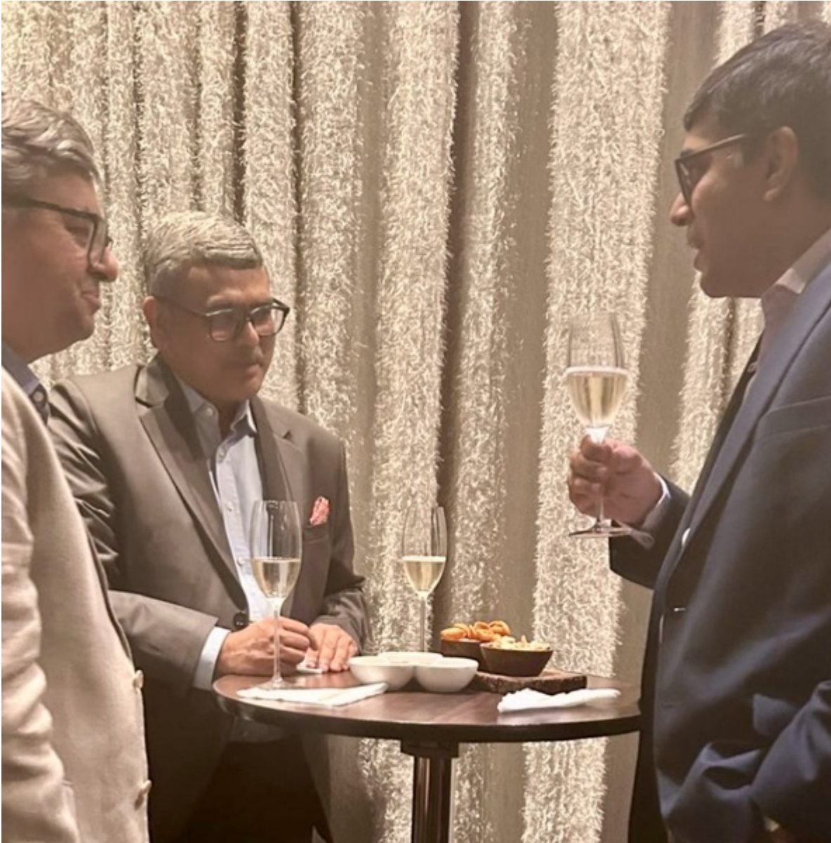
Guests relishing the Prosecco

This Prosecco comes from the Veneto region in North East Italy and is made with the glera grape varietal. Made in the frizzante style it revealed itself as a light, crisp and a lively Prosecco. Everyone appreciated its vibrant character and relished it with the small bites.