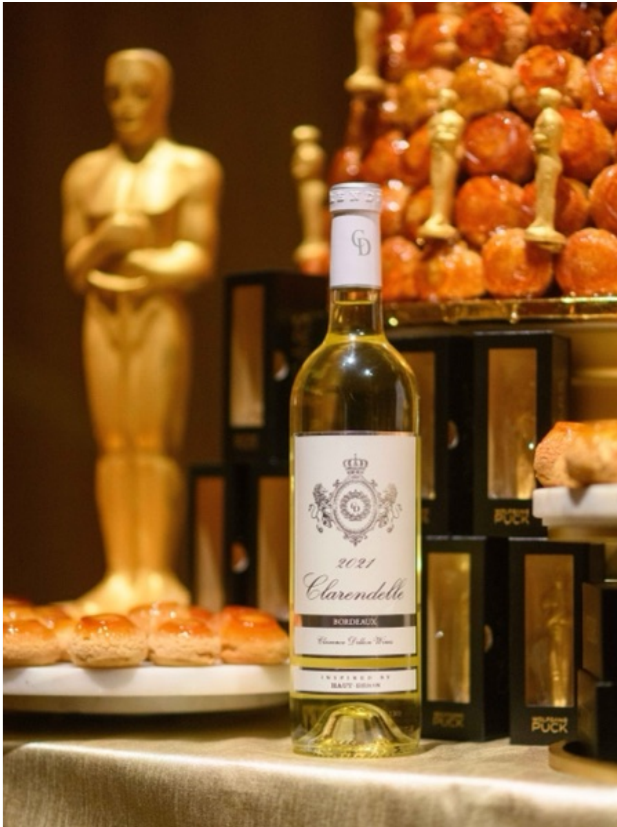
Clarendelle Blanc gets served in various ceremonies at the Oscar.

Interestingly Clarendelle brand is owned by Prince Robert of Luxembourg, who in addition to this is also the owner of Chateau Haut Brion – the legendary first growth wine estate located in Bordeaux. With Clarendelle, Prince Robert wanted make wines which truly reflected the Bordeaux terroir and at the same time which were both approachable and affordable. And with that in mind he created the Clarendelle brand of wines.