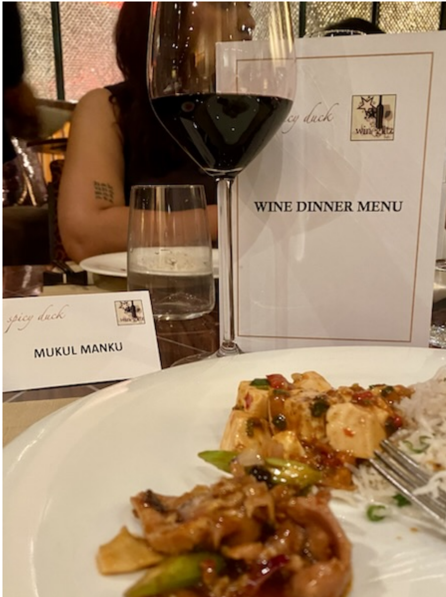
Penfolds Bin 389 in the main course

The turn of tide happened from 1956 onwards when these very wines started to get top honours in various wine competitions in Australia including the famous Sydney Wine Show. These wines soon gained prominence and became iconic wines commanding high prices – a legacy which continues even today.