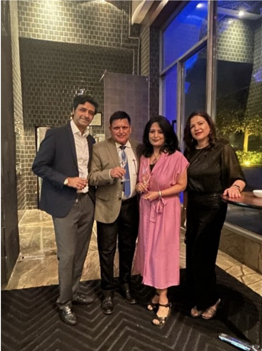
The starter course

Our club dinners are usually planned with five courses and four wines. Like always, this one began with the starter course and was held at the Blue Bar of Taj Palace, giving guests a chance to meet, chat, and break the proverbial ice. The Italian sparkling wine Casa Bottega Brut DOC was served generously along with some delectable snacks, making for a relaxed and enjoyable start to the evening.