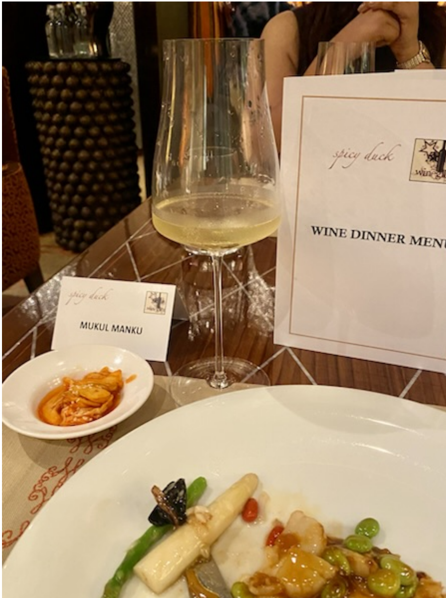
Clarendelle Blanc ?? Inspired by Haut Brion

Three grape varieties go into making of Clarendelle Blanc. First is the Sauvignon Blanc which adds a lot of freshness to the wine, then we have Semillon which provides the wine with body and structure and lastly the Muscadelle which gives an aromatic lift to the wine.