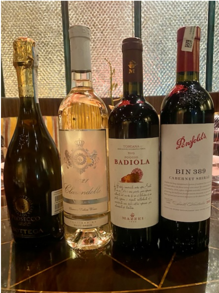
The lineup of wines

We had a flight of four wines that day â?? one sparkling and three still wines. Two of these were from Italy and one each from France and Australia. A brief on all these wines is given in the paragraphs that follow.