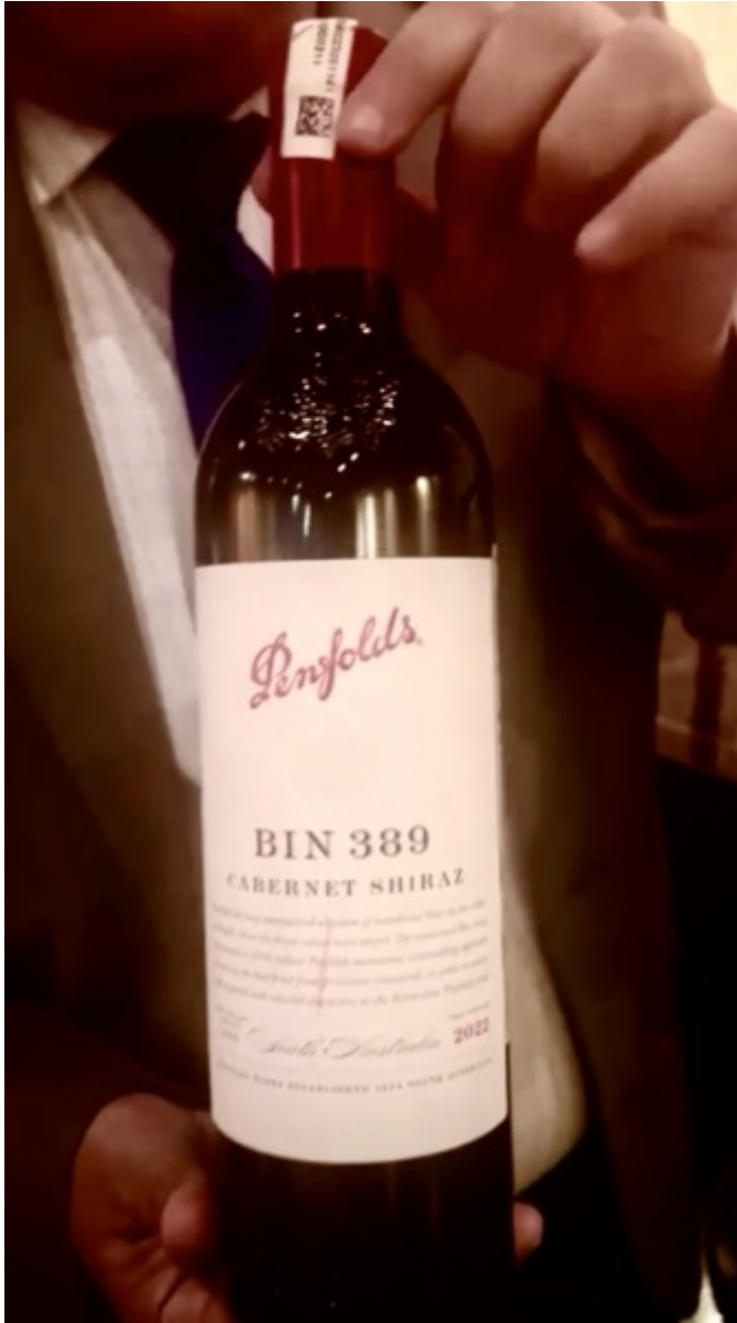
Penfolds Bin 389 - The Baby Grange

With that we arrived at the last wine of the dinner which was also the King of Wines that day. It was the Penfolds Bin 389. Penfolds as we know is one of the most iconic wine brands of Australia.