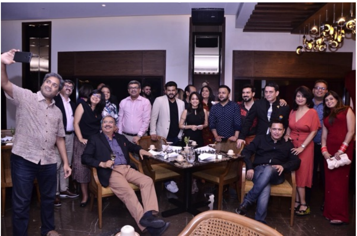
First Wineglitz Dinner at OKO Restaurant in Hotel Lalit New Delhi

In hindsight, to organise this wine dinner at such a large scale, so early in my wine journey was the hardest wine related decision I ever made