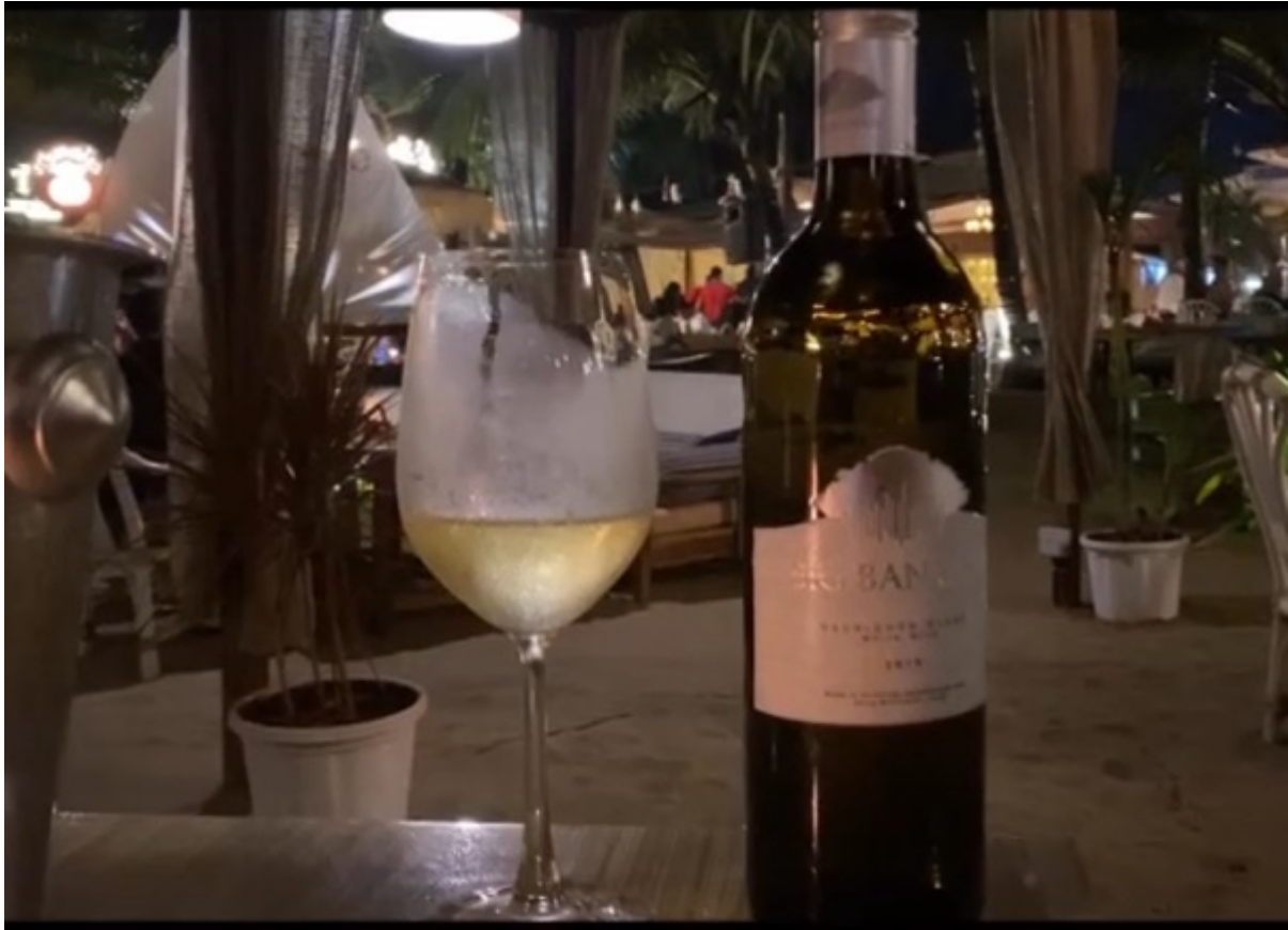
Big Banyan wine

I'm tempted already to book the tickets to Goa. And what about you ?? mountains or beach ? And why?