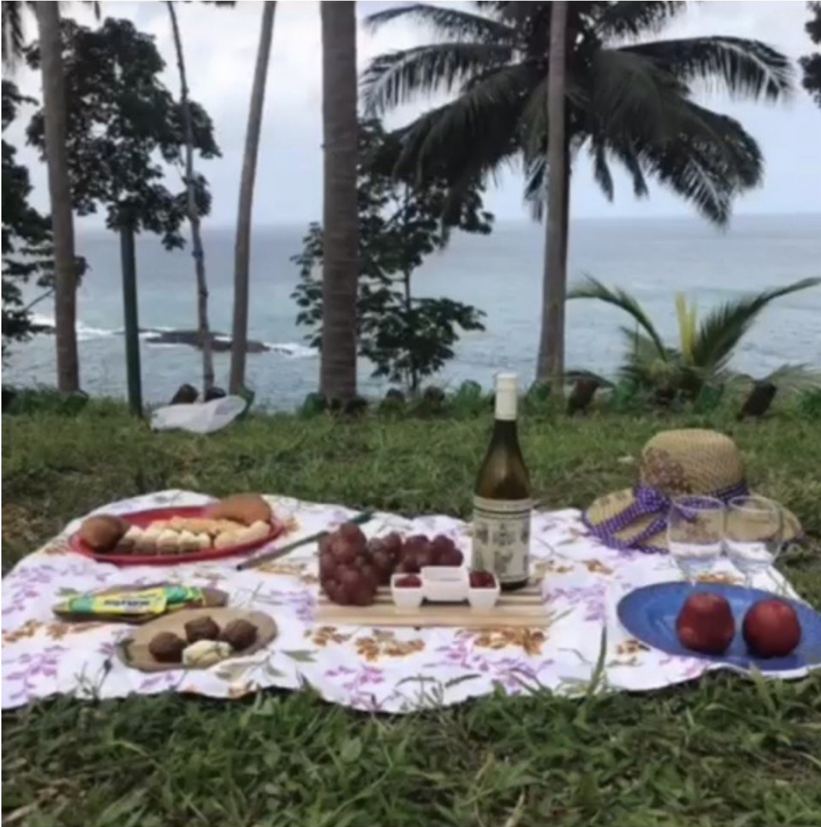
Picnic at the sea

3. Experience the magic of the beach sunset with a glass of wine