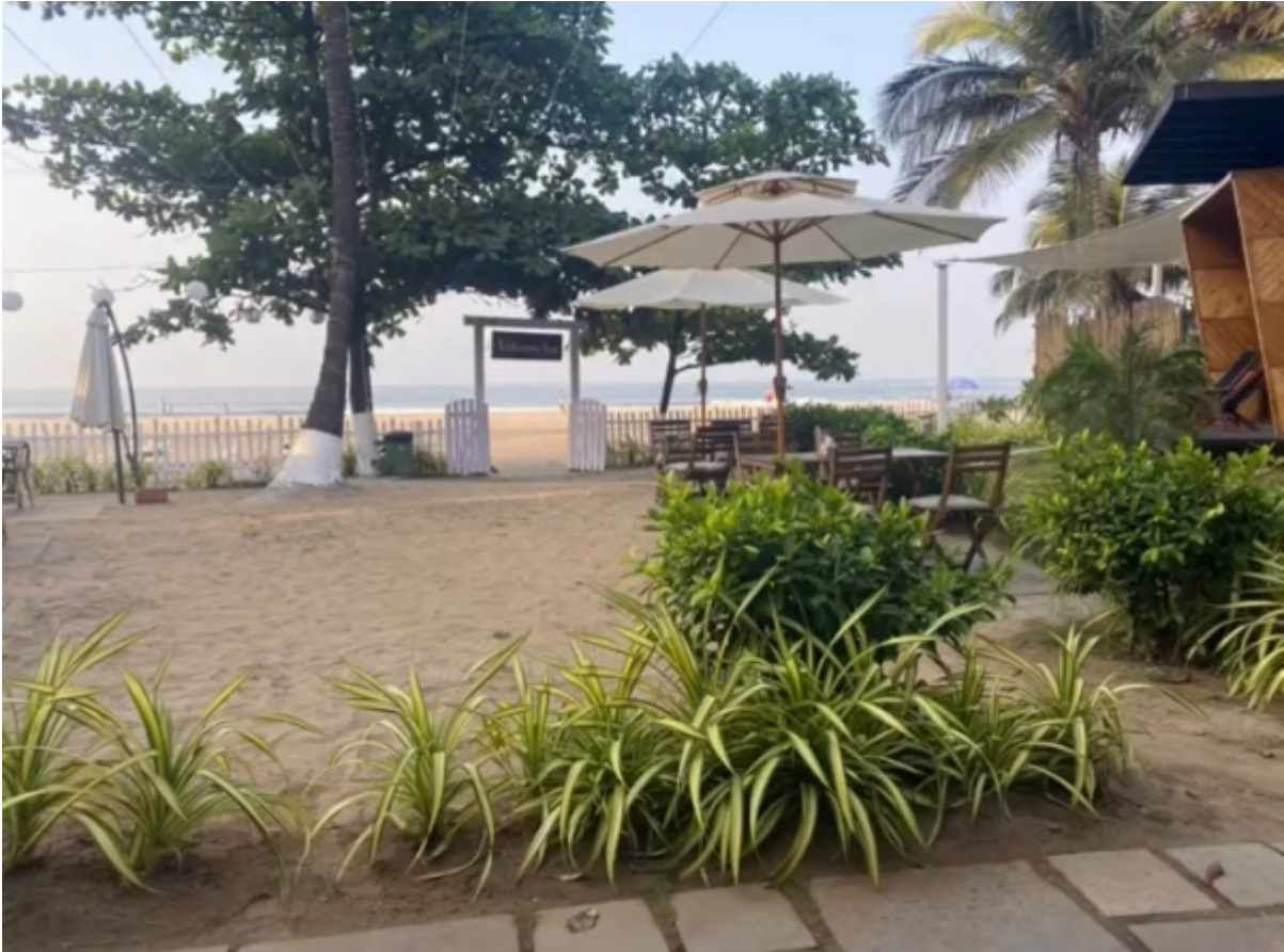
Beach Resort at Arambol Goa