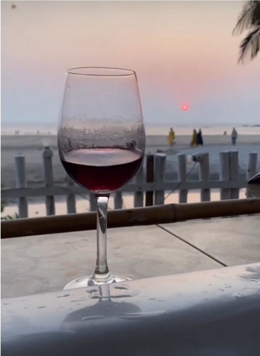
Sunset at the beach

4. Catch up on some reading at the beach