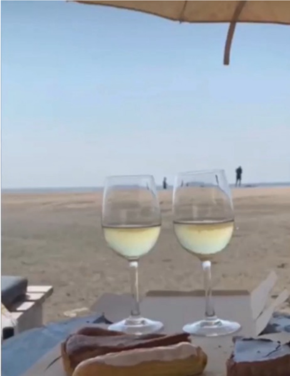
Wine for two please

6. Enjoy the sea side nightlife over wine