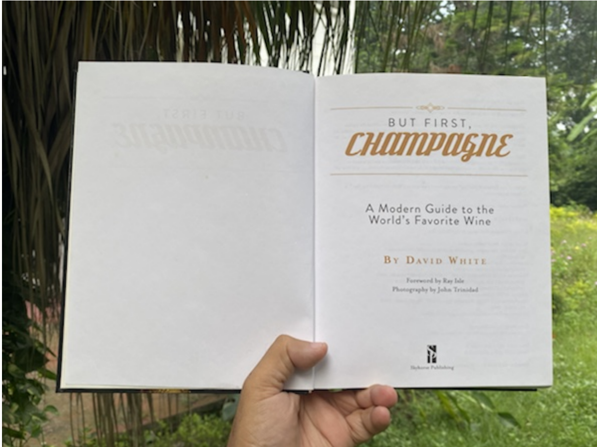
A modern guide on Champagne

So my #1 priority tomorrow is to finish reading the book titled But First Champagne .