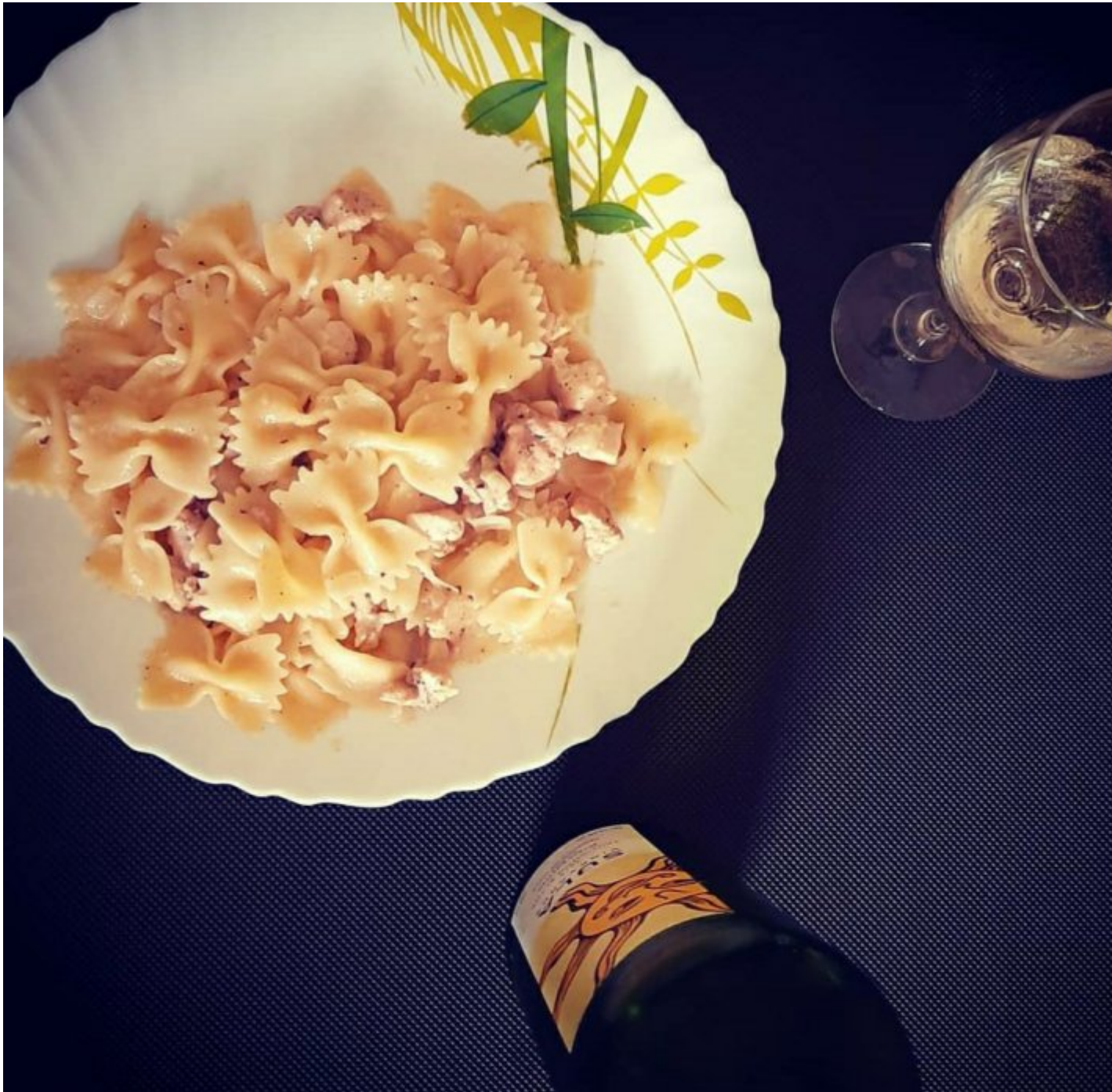
Sauvignon blanc & chicken pasta : a perfect pair

Next was the black pepper cream chicken prepared in a light cashew based cream made at home and some sandwich bread pieces go to along with it. Keeping in mind the fresh, fruity flavors of the sauvignon blanc, the cream was kept light which was easily balanced by the medium plus acidity of the wine resulting in a good pairing.