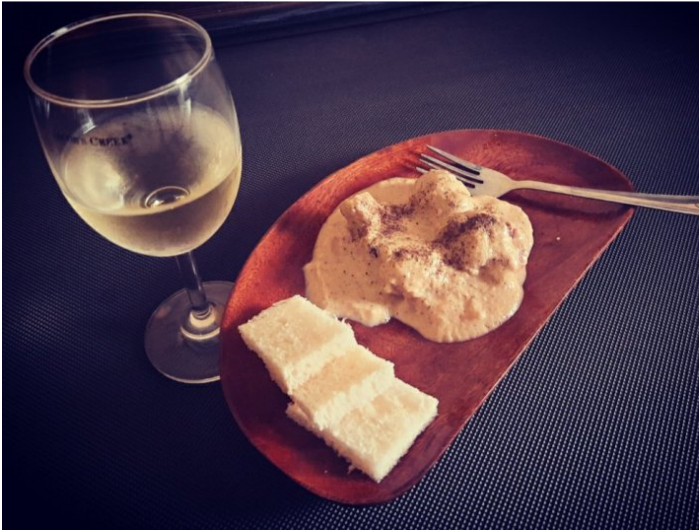
Sauvignon blanc with black pepper cream chicken

Pairing principle tried in both the dishes was to pair the acidity of the wine with light cream in the food (had the cream been rich, it would have over powered the wine). But here the acidity and the cream balanced each other perfectly thereby preparing the palate to savor the flavors of the food. So it worked.